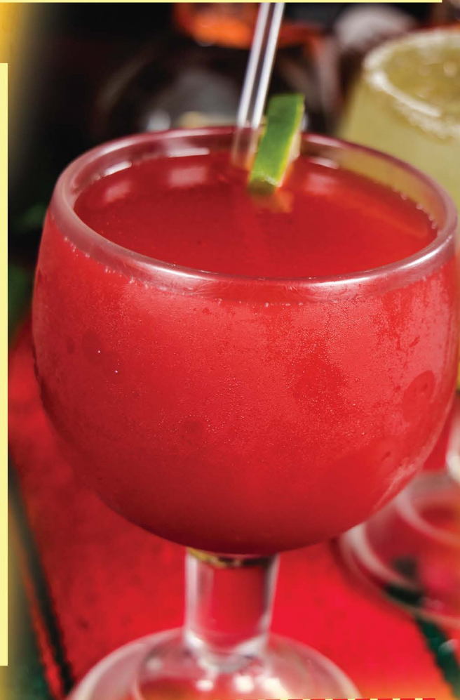
CHICKEN - STEAKS

Ribeye steak with grilled mushrooms served with lettuce, guacamole, sour cream, pico de gallo, rice and beans. 12.99