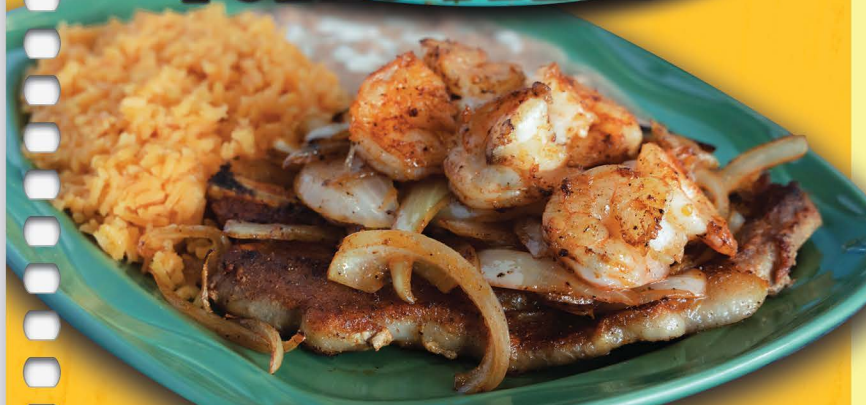
STEAK & SHRIMP