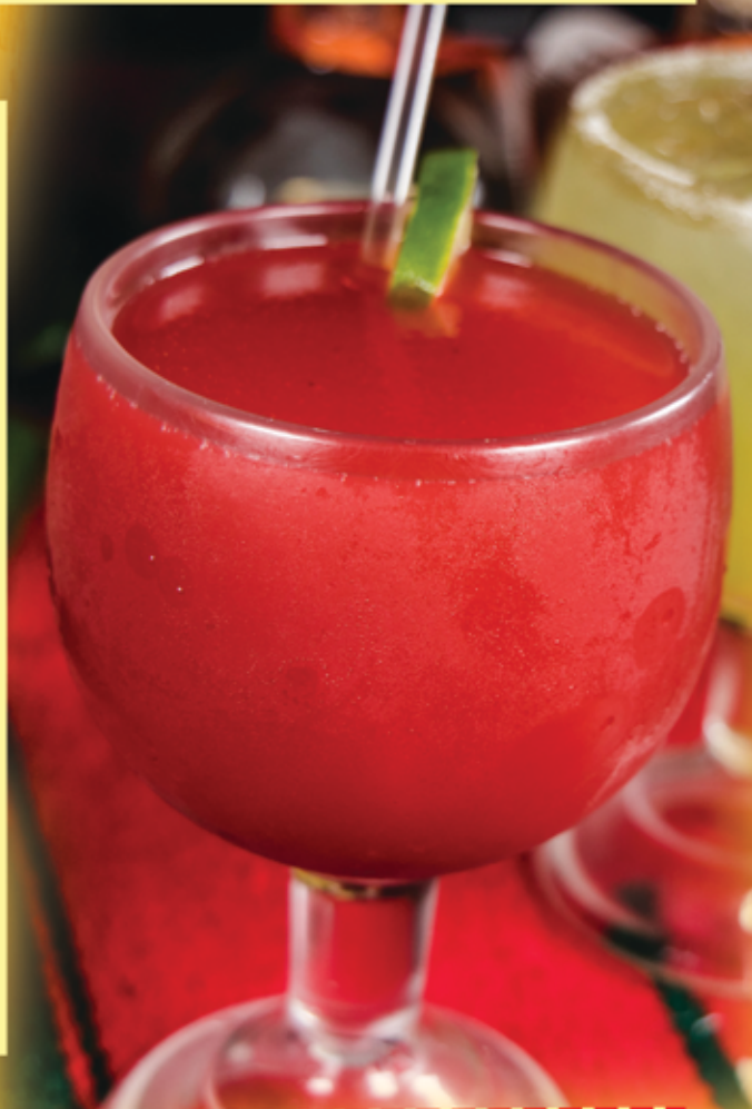
CHICKEN - STEAKS

Ribeye steak with grilled mushrooms served with lettuce, guacamole, sour cream, pico de gallo, rice and beans. 12.99