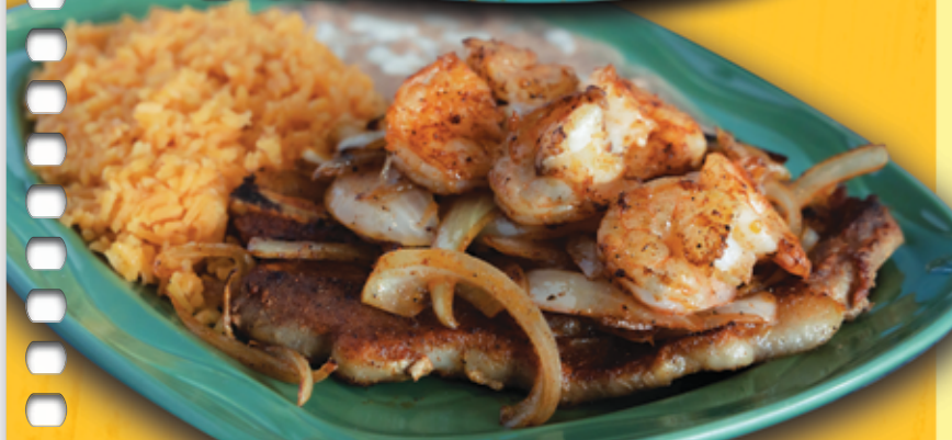
STEAK & SHRIMP